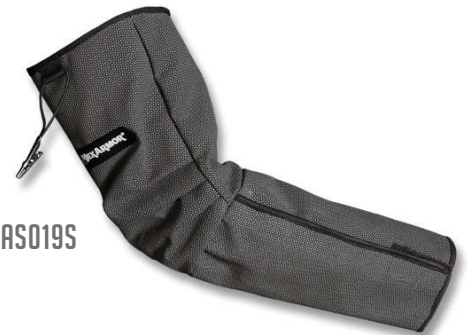
ARM GUARD AS019S