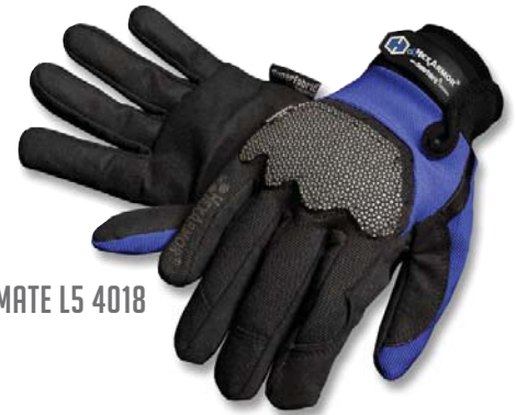
ULTIMATE L5 4018